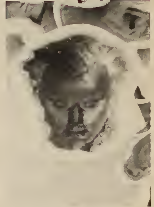
Face cast of Leo Mol's Shevchenko monument erected in Washington, D.C. 1964.