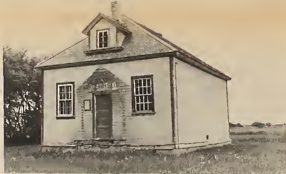
Kosiw Schoolhouse, 1914.

On one of their field trips, the VIDEO-SUSK centre attempted to capture some of the historical aspects of the area in an extensive audio-visual presentation - another "documentary" to be ready for airing on cable television networks by the fall of '72.