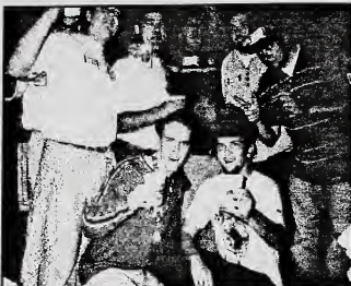
Waterloo hosts SUSK Eastern Conference in conjunction with Oktoberfest weekend. More photos are available for viewing on the SUSK webpage at www.susk.ca .